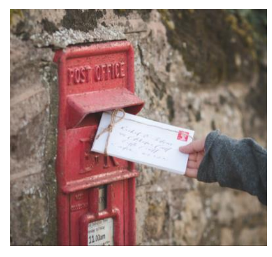
LONDON LETTERS a petite atelier

The London Letters Writing Society is a community of hundreds of keen letter-writers and pen pals from across the world put in touch to revive the art of correspondence. Take a moment from your day to relax and put humble pen to paper, and make a new friend whilst you're at it. Our pen pal club was founded in 2017 with the goal to unite those people still interested in the written word. We've now just over 400 members, who are enthusiastic about snail mail and keeping this relaxing hobby alive.