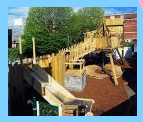
Notting Hill Adventure Playground W10 5YB 10.30am - 3.30pm