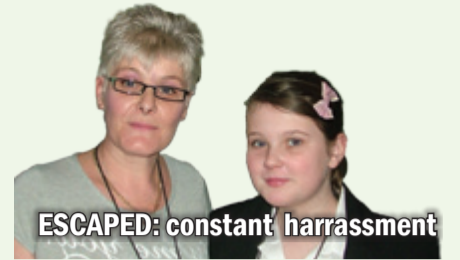
ESCAPED: constant harrasment

HOUSING advice saved a mother and young daughter from a living nightmare as new neighbours launched a campaign of constant harassment.