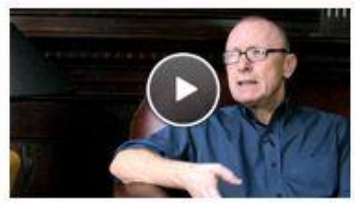
Learning you are HIV positive