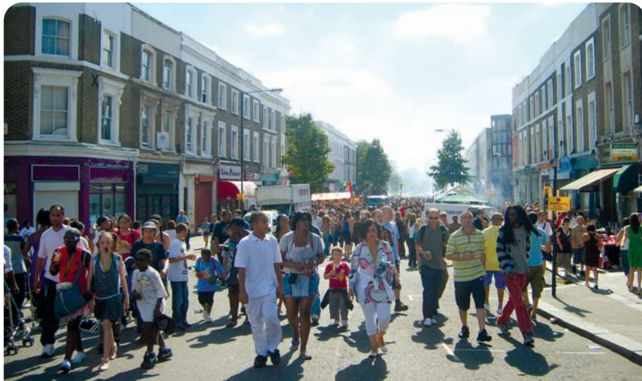
Golborne Road during the Notting Hill Carnival: The area's rich diversity and range of cultures is something many people value and want to preserve.

After speaking with around 70 local residents from the Golborne ward on what it is like to live in Golborne, the Social Council in partnership with several voluntary and community organisations held a dialogue session with Golborne residents on 3 May to discuss ways of improving the area and the lives of people who live locally.