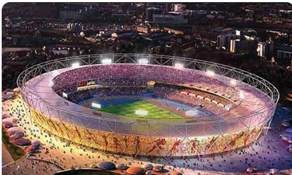
The Olympic Stadium has transformed the landscape of East London but will there be any lasting transformation for our communities?

The council’s Transport Environment and Leisure Service Delivery Plan also refers to a legacy for Kensington and Chelsea. It states its aim “to capitalise on the 2012 Olympics and Paralympics to promote recognition of the royal borough as a place for creativity and innovation, and increase