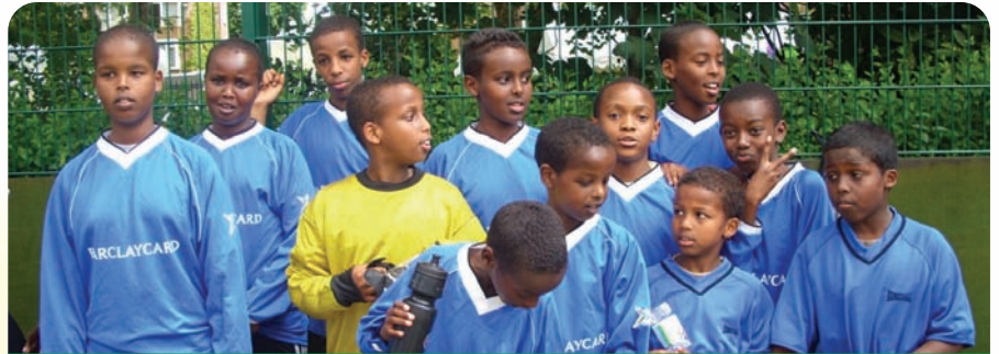
The Baraka Youth juniors football team practise every Saturday at Westway.