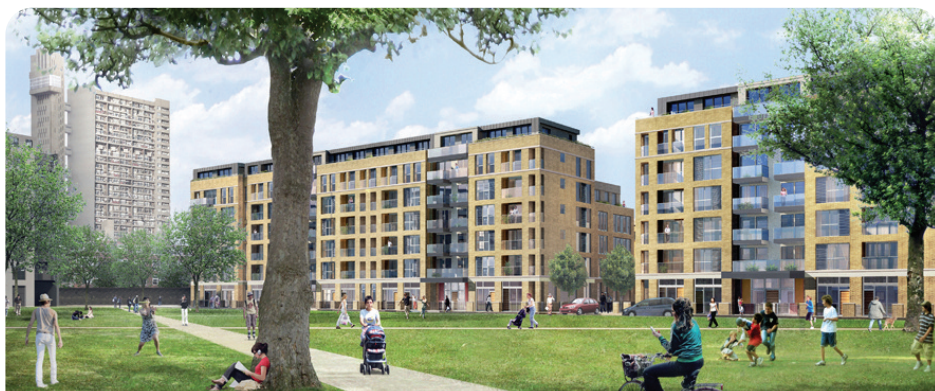
An artist's impression of the Wornington Green development currently under construction in North Kensington. There is concern that many people currently housed in the area will not be able to afford to live there much longer.